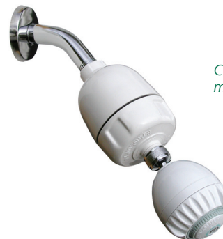
CQ-1000 with the Shower Pro massage head