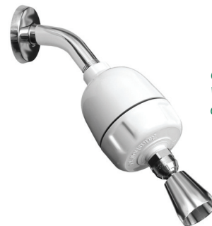
CW-1000 with the Whedon fixed-action designer head

Rainshow'r® uses a number of shower heads, handheld kits and water control devices. These are water delivery mechanisms only. They are not performance tested or certified by WQA. Only the filter is certified.