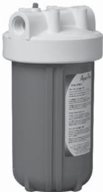
AP801 / AP801-C