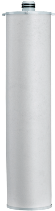
CC1E Cartridges EV9105-02

High flow, high capacity carbon filter for chlorine and chloramine reduction